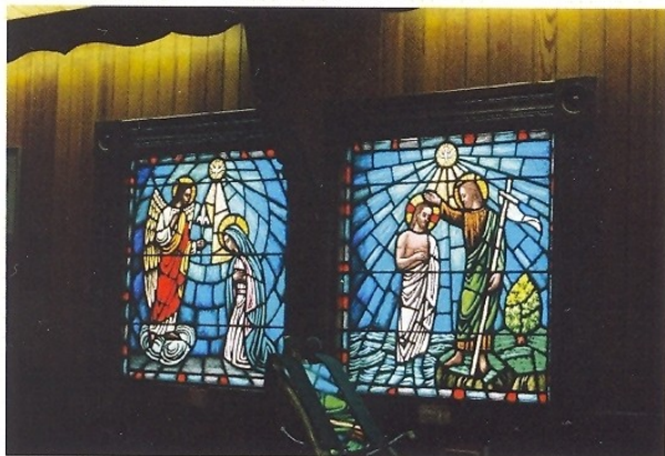
The Annunciation of Christ and The Baptism of Christ

Painted details and yellow stain are often used to enhance the design.